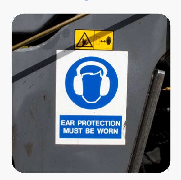
Look out for signage and noisy equipment

Ask your employer or safety officer for guidance on the type and class of hearing protection that is right for you.